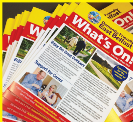
Online and in person workshops