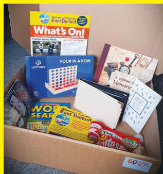
Hug in a box