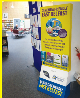
Info hubs across East Belfast